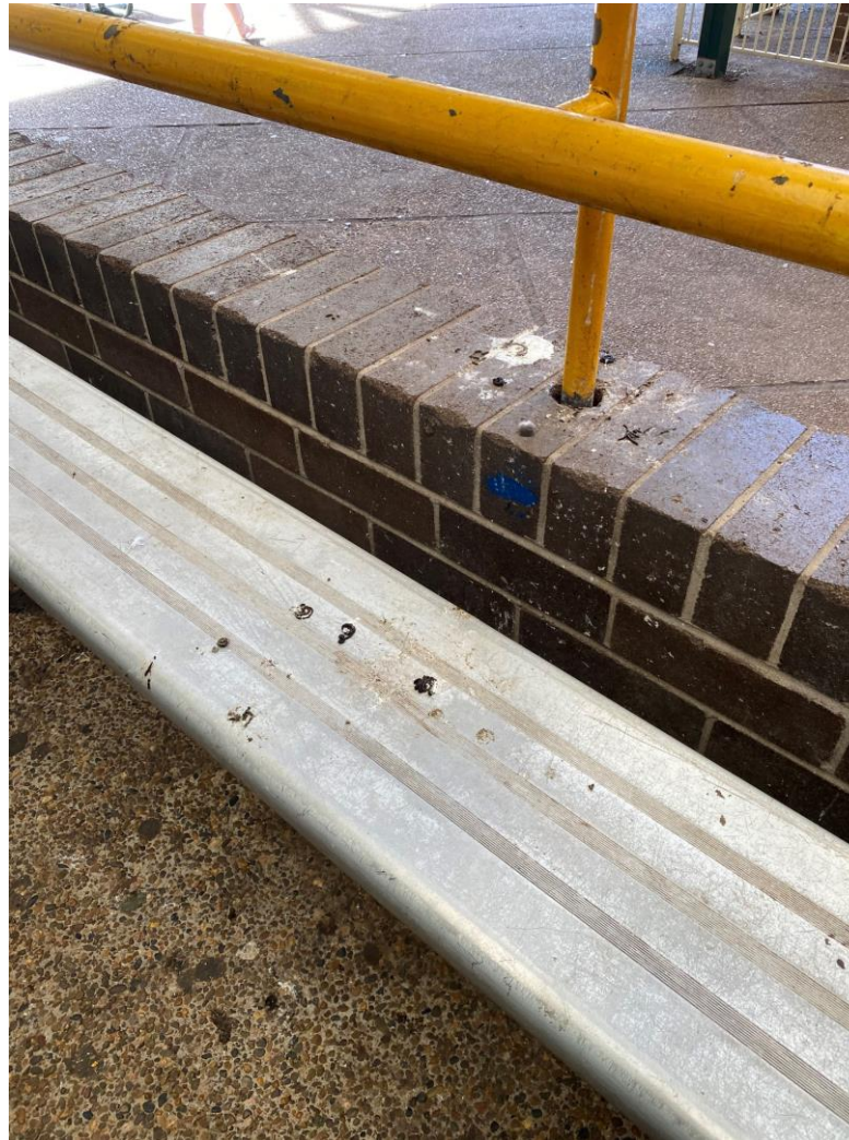
Bird poo on seats near the canteen where children sit and eat their lunch