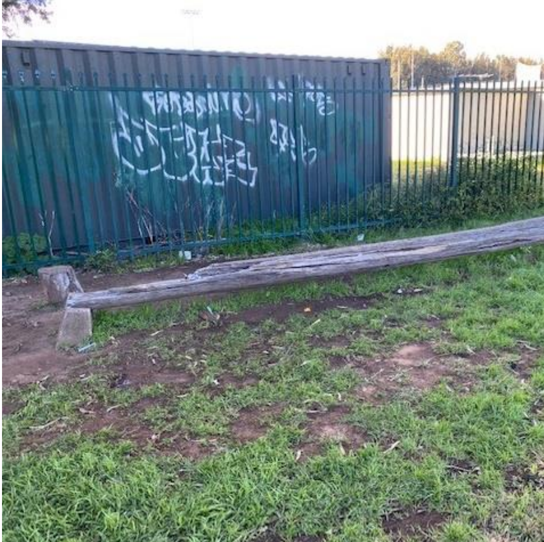
Broken logs at the side of the school oval where children are expected to sit