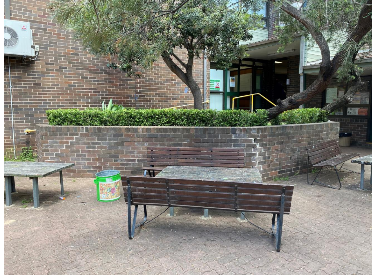
This furniture is estimated to be around 20 years old, splintering and unstable... also covered in bird poo