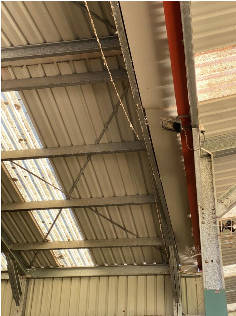
Bird poo and feathers in the roof of the COLA, children sit under this COLA to eat their lunch