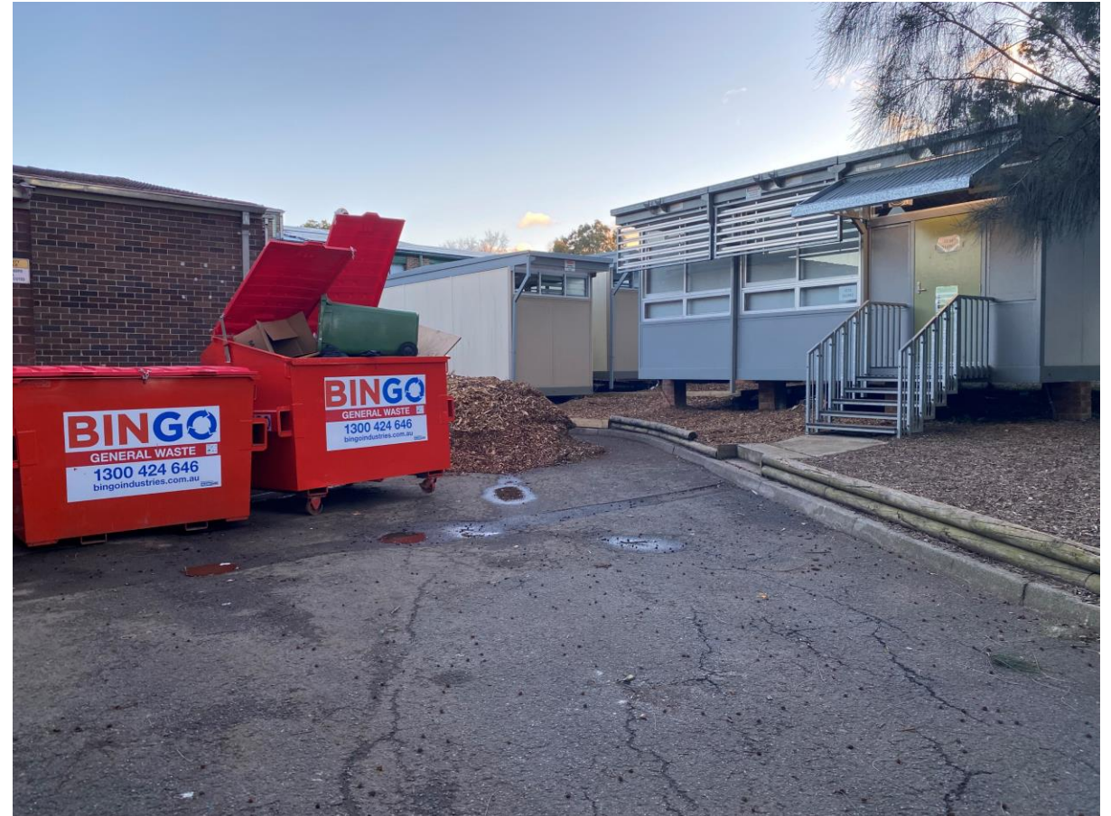
Large dumpster bins sit right outside poorly placed demountables